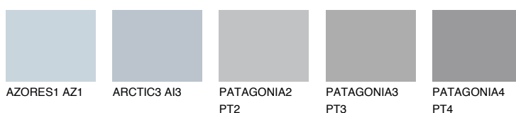
AZORES1 AZ1 ARCTIC3 AI3 PATAGONIA2 PT2 PATAGONIA3 PT3 PATAGONIA4 PT4